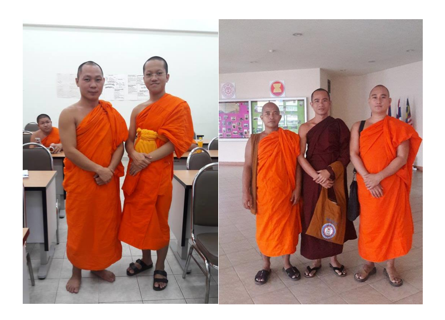
Figure 5 Burmese students live, study and do activities during studying at Buddhist University (Source: Author, 15 November 2017)

From the appearing state, most of the students are ethnic in Myanmar dimension. Most of them are different in culture and religion which is characteristic of ethnic groups related to food, history and beliefs. Therefore, the relationships between groups are different or not completely related including practices in the form of Buddhist monks in terms of conditions and differences that occur under conditions and possibilities until it becomes behavior and actions in a holistic manner.