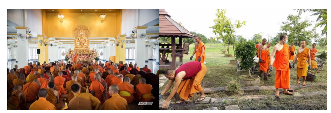
Figure 9 Students join together to do Buddhist ceremony and practice including help each other to clean and look after the area of their loving within the university.

4. Religious activities and coexistence activities, that is to say, most of the students are monks and novices. In the university, there are 2 main sects, Mahayana from China, Vietnam, Taiwan and Theravada from Laos, Myanmar, Vietnam, Cambodia, Thailand, Bangladesh, Sri Lanka. When they come together in the same religious culture, there are activities that follow religious principles such as Khao Phansa, Kathin, Pa Pha, or important Buddhist Day on Visakha Puja Day, or the prayer of students on this point is a religious practice. This can also leads to mutual learning on cultural differences. When it specifically goes down to Burmese students, the interaction between each other leads to the learning, acceptance, and adjustment of attitude to positive communication together including that the university has stipulated to conduct cultural demonstration activities, as in the case of orientation for new students to have knowledge about Thai culture or each other's culture, resulting in learning and understanding in each other including the students in the name of Burmese nationality participated in activities by learning to adjust positions to the historical and ethnic sense which is believed to be lighter and more positive interaction (Interview Executives D, 21 December 2017).