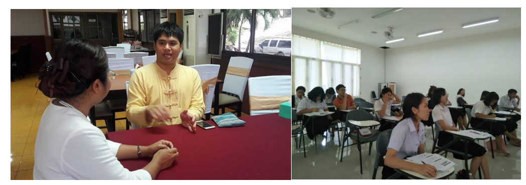
Figure 10 Interview Lecturer from Bhodhivichalaya Srinakharinwirot University, Mae Sot District in Tak Province, on 12<sup>th</sup> October 2017