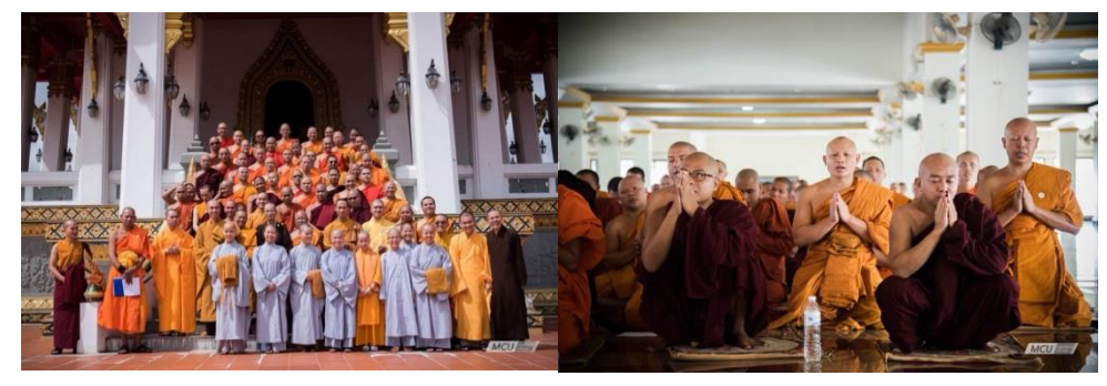
Figure 7 Students attended the activities related to Buddhist Ceremony

around Mahachulalongkornrajavidyalaya University or temples in which that monk can communicate with each other. However, in the case that cannot speak Thai at all, most of them are at the dormitory for the reason that they cannot communicate with the abbot in Thai temples and most of them can speak Thai as well (Interview Executive B, 27 December 2017) during staying in a dormitory. Therefore, there are activities due to living together such as praying, chanting, residential development, cleaning the place. For example, there will be a cleaning day to clean the accommodation, joint housing development every week that resulting in communication and joint activities which cause a positive interaction between students inside the university dormitory.