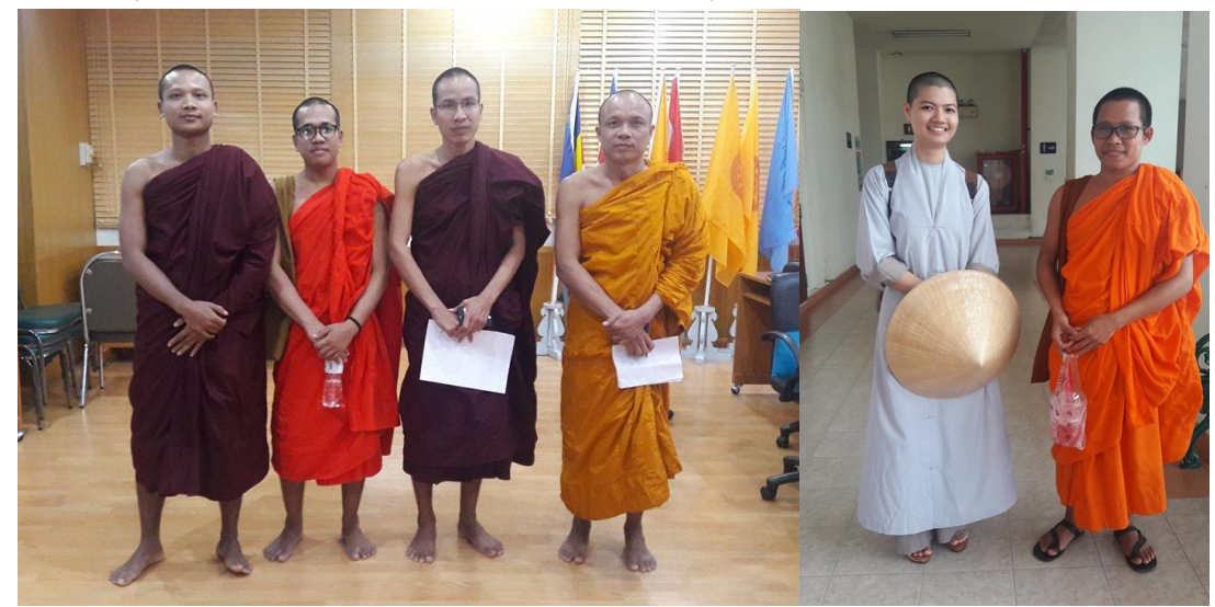
Figure 4 There are 4 monks students from 4 ethnic groups which are Burmar, Rakhine, Pa-O and Kaya from Myanmar. They are also two Vietnamese students who have different Buddhist sects.

The Tai Yai group at the Buddhist University can be divided into 2 groups, which are from Shan State in Myanmar and hold a passport from Myanmar by having knowledge and understanding of Thai language. They studied in 2 courses with experience go in and out and study in Thailand such as from Nan Sangha College, Chiang Mai Campus, Lamphun Campus, Lampang Sangha College, etc. For group 2, they have an immigrant background and a pink card and being a Buddhist monks who studying in Thailand. They study in Thai language course and hold a foreign card which is a hidden population in the Burmese ethnic group. When counting informal statistics, this group of students is up to 200 students and activities are conducted in the form of clubs as well as interacting with other Tai Yai groups that have settled and worked in Thailand (Interview Student B, 26 November 2017)