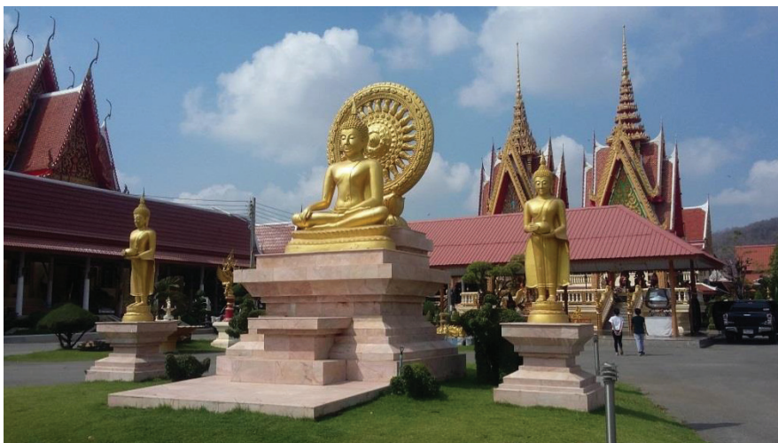
Figure 1 Applied Construction photo

5. Lack of knowledge of Discipline / legal means of Buddhist Monks, who served in the administration. infrastructure management No knowledge of the law school building, architectural or laws relating to the construction of places of worship in the temple, as the law remains. Law Building Or rules to other facilities in the building or not. As a result, the monks Buddhist Monks several criminal acts in ignorance. Knowledge and discipline. Applied to the media that reflect the principles of Buddhist teachings to maintain or preserve the ideals of Buddhism them. It creates a form of public appearances principle was not reached. The construction was not an audit work, the law will affect purity. Transparency, accountability Buddhist Monks so many people have been prosecuted in the budget. The budget and the construction of a wrong plan and so on.