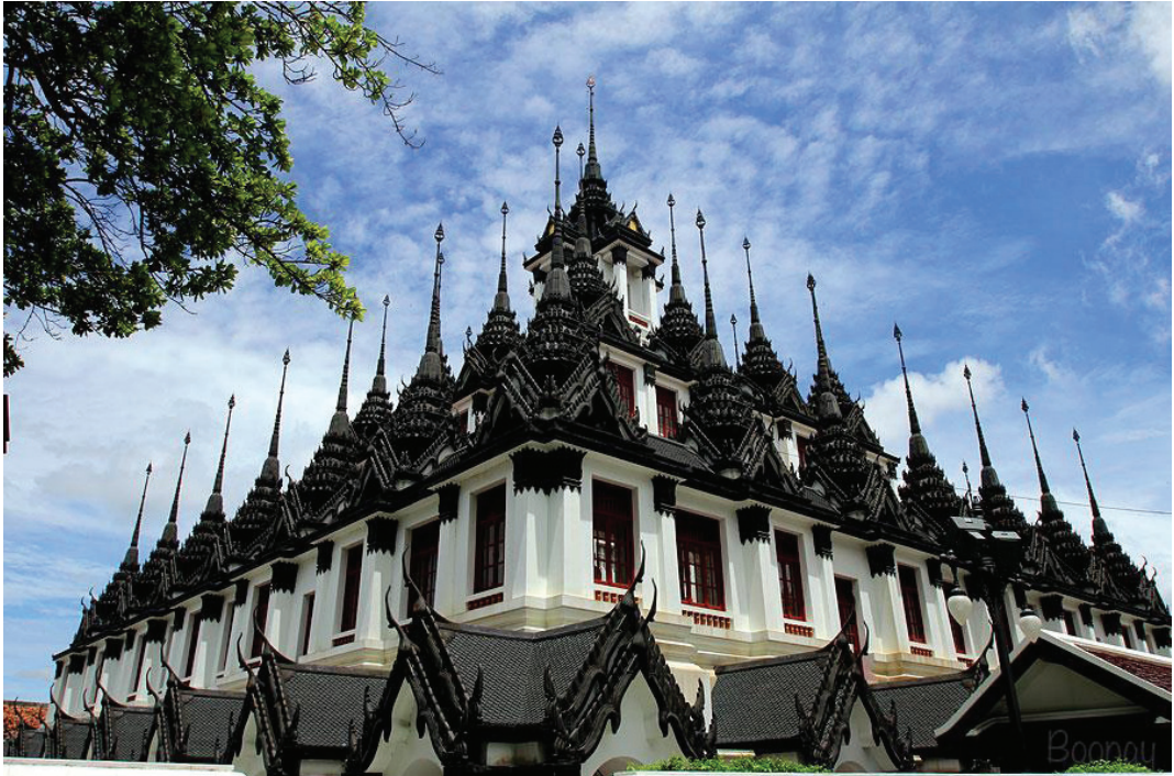
Figure 2 The Loha Prasat at Wat Ratchanadda in Bangkok , a multi-tiered structure 36 m. high and having 37 metal spires signifying the 37 virtues toward enlightenment (Picture : online)

4. Easy to use (a week too) refers to the construction of a building or facility. Comfortable living It is best to take the workload and the need for it. Including both physical comfort. The need for the Cascades is truly suitable for use. In a week of her mind. The practice refers to places that need support to access to religious ideals, such as the construction conforms to the wild nature. As to the complementary principle. A place Rmni Delightful for access or practice so the Buddhist community that could mean easier access. Not far from the city and community facilities such as bathrooms, waterfront, residential facilities suitable for the age and gender, as well as threatening the living conditions of practice. So what must create a design concept. The building is going to facilitate both in private practice and the principles of a climate conducive to the withering of the service users on what caused the other utilities.